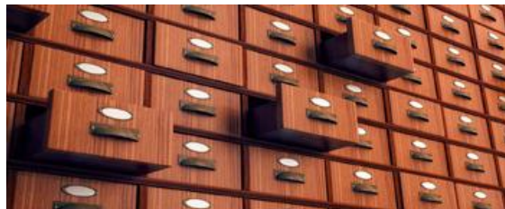
Delaware County Weekly Archive