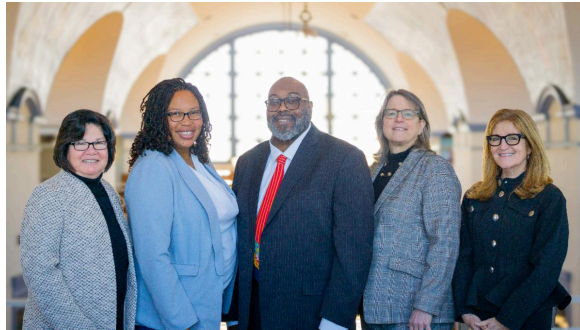
Delaware County Council members

Residents are encouraged to sign up for the 2nd Annual Delco 10 Miler, scheduled for Sunday, October 4 . Like last year, the race will begin at Rose Tree Park in Media and end at Subaru Park in Chester with a celebration at Union Yards. After selling out 1,500 spots last year, this year's race will feature 2,500 runners. Organizers have already seen hundreds of runners sign up , so residents are encouraged to sign up ASAP . Please note that there is a 13:30 per mile pace requirement. If you aren't interested in running, please consider signing up to volunteer. For more information, visit delco10miler.com .