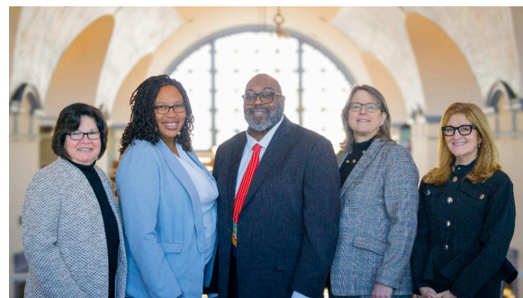
Delaware County Council members

The Foundation for Delaware County invites residents to participate in the 3rd Annual Delco Gives. Last year, over 11,000 people raised nearly $2.3 million for 306 nonprofits across the County. This year, a series of community events will celebrate the initiative, including the Delco Gives launch party at Dining Under the Stars on State St. in Media on Wednesday, May 6. The closing celebration will be held at the WSFS Bank Sportsplex on Thursday, May 7. You can learn more by visiting delcogives.org . Learn about volunteer opportunities by clicking here .