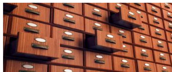
Delaware County Weekly Archive