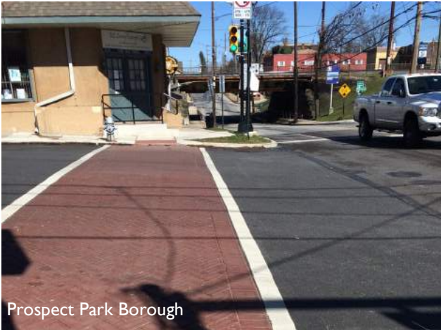
Prospect Park Borough