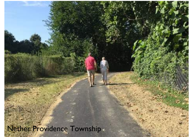
Nether Providence Township