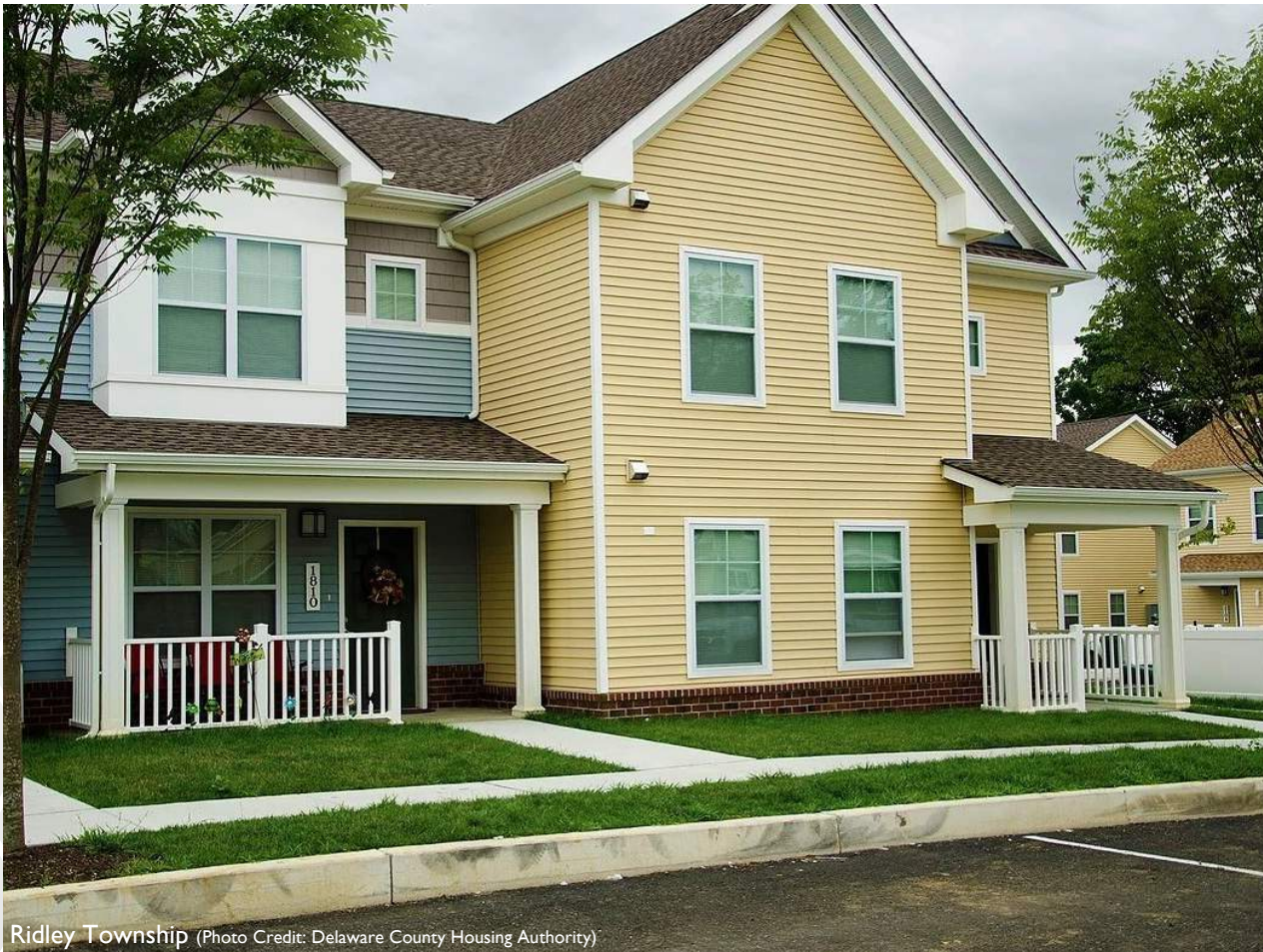
Ridley Township