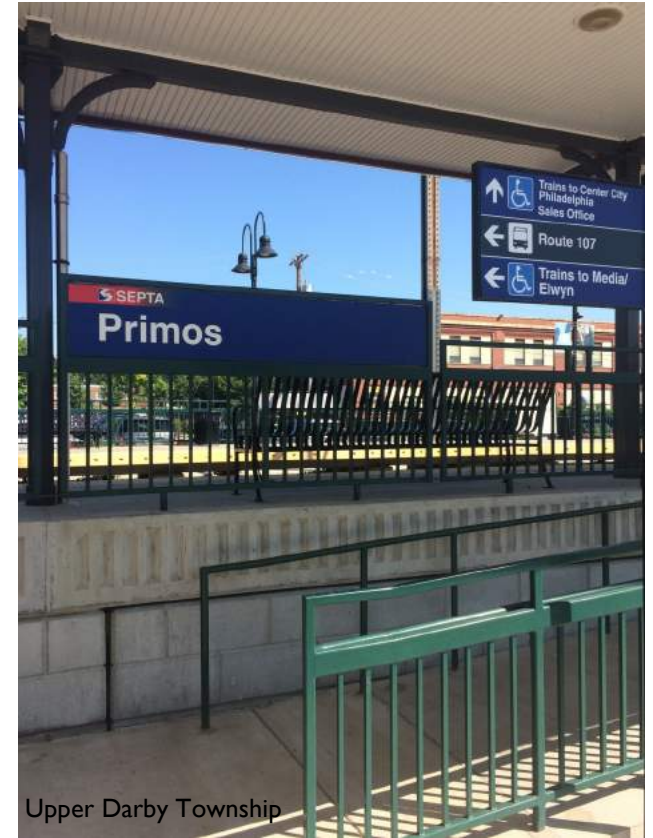
Upper Darby Township