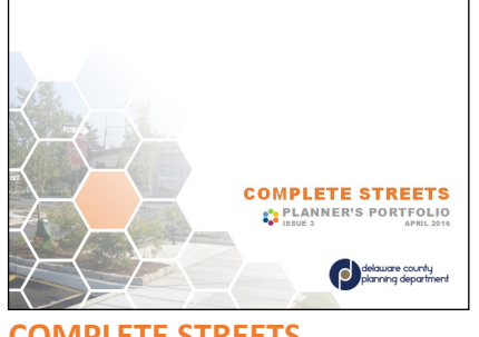
COMPLETE STREETS April 2016