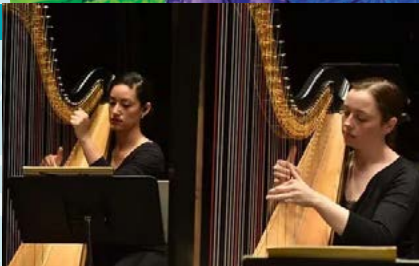
Delaware County Symphony • June 12

Orchestral favorites bursting with excitement! A full symphonic orchestra performs extracts from Beethoven's 6th Symphony , Carmen , popular marches, and special surprises.