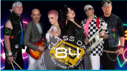
Class of '84 • June 29

This large community band gets faces smiling and toes tapping! Wide variety of musical selections includes Big Band, Broadway, Classical, Pop, Patriotic & Marches.