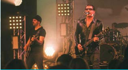
Mysterious Ways • July 11

Award-winning, Philly Folk Rock band that blends four-part vocal harmonies with infectious rhythm and horn arrangements into a new, genre-bending sound.