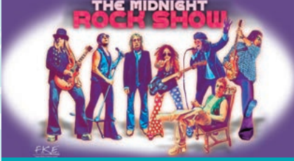
'70s Midnight Rock Show • July 27

Celebrate summer in beachside style! It's all your favorite Jimmy Buffett songs and sunny classics by Bob Marley, The Beach Boys, Zac Brown, and more.