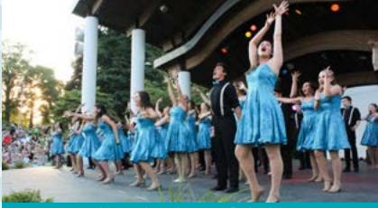
Shooting Stars • July 20

American Jazz and Brazilian rhythms on piano, guitar and vocals, accompanied by drums, bass, sax, flute, trumpet. Beautiful Bossa Nova, sultry Samba and more!