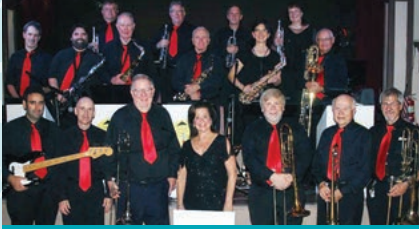
22 Park Avenue • July 28

High-energy, seven-piece band covering the extensive Billy Joel catalog. From the fan favorites to the deep cuts, these guys are "Keeping the Faith!"