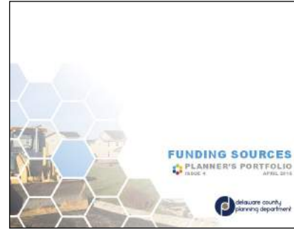
FUNDING SOURCES April 2016