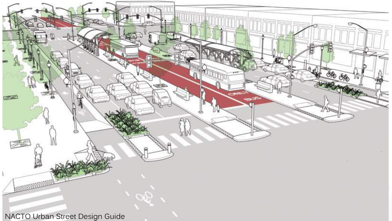
NACTO Urban Street Design Guide