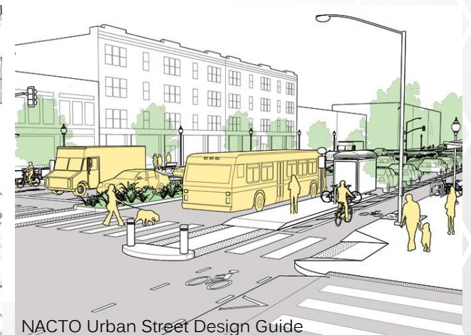
NACTO Urban Street Design Guide

Examples of roadways similar to Activity Corridors with complete street designs (right) show several of the opportunities to better integrate transit, bicycle facilities, and parking with travel lanes to optimize current roadways.