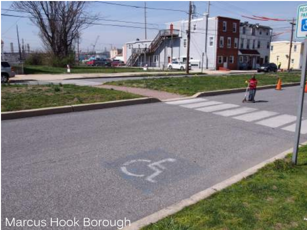
Marcus Hook Borough