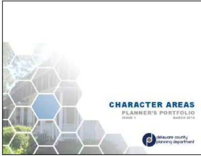
CHARACTER AREAS March 2016