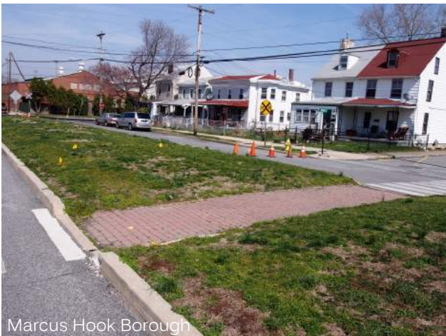
Marcus Hook Borough