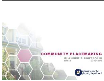
COMMUNITY PLACEMAKING March 2016