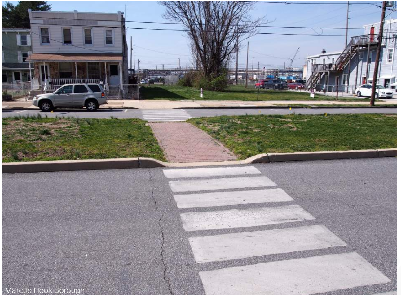
Marcus Hook Borough

Market Street in Marcus Hook Borough has wide sidewalks along its length, increasing comfort and safety for pedestrians. The section of roadway between 3rd and 4th streets, however, is wider than normal due to a grass median. While the median helps to slow down traffic through the area, it also extends the distance pedestrians need to cross. To address this issue, the borough has installed mid-block crossings that include painted crosswalks and a paved path through the planted median. This increases the visibility of pedestrians and reduces both crossing time and distance.