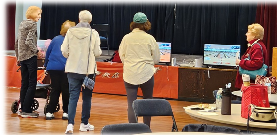
Wii Bowling Tournaments

Wii Bowling event each year. The participants compete for gold, silver, and bronze medals. Medals are awarded in several age categories.