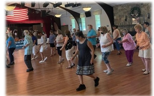
Line Dancing Lessons & Socials

The Redwood offers a variety of entertaining programs, including senior social dances, country line dancing, Wii Bowling, weekly exercise classes, arts & crafts instruction, and more.