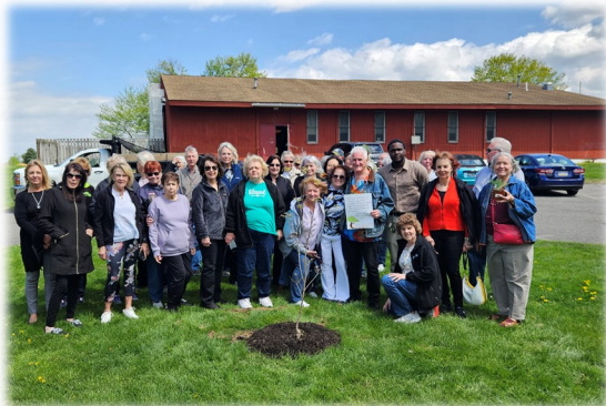
Earth Day Tree Planting

Upland County Park is the home of the Redwood Community Center, a county-operated facility which provides free programming each week for hundreds of local seniors. It's a perfect gathering place for community group activities.