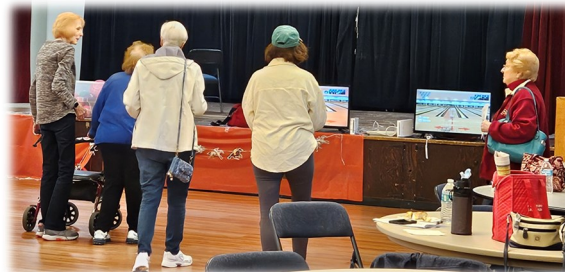
Wii Bowling Tournaments

The Redwood hosts the annual Delaware County Senior Games Wii Bowling event. Participants compete for medals in several age categories.