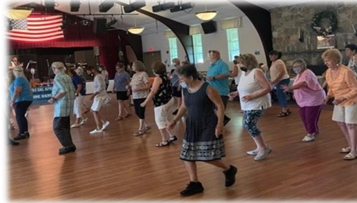
Line Dancing Lessons & Socials